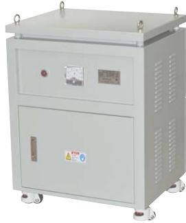
Munsell No RAL 7035