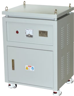
Munsell No RAL 7035