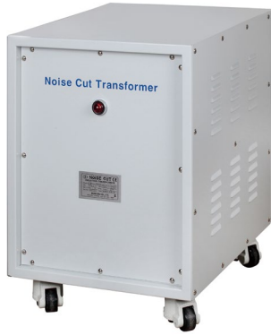
Munsell No RAL 7035